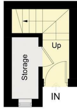
Ground Floor Entrance

Illustration for identification purposes only, measurements are approximate, not to scale. Fourlabs.co © (ID1228002)